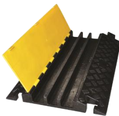
Additional Cable Protection